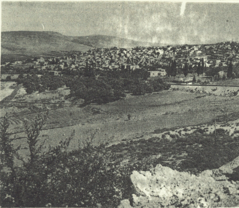
Cana of Galilee — John 2:1-2