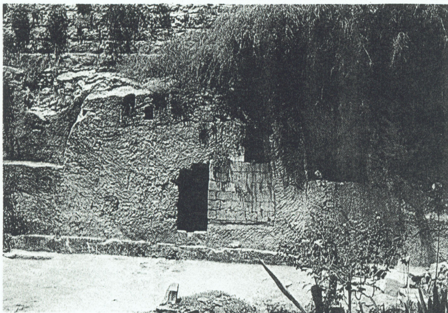
The Garden Tomb

"But if the Spirit of him that raised up Jesus from the dead dwell in you, he that raised up Christ from the dead shall also quicken your mortal bodies by his Spirit that dwelleth in you." Romans 8:11