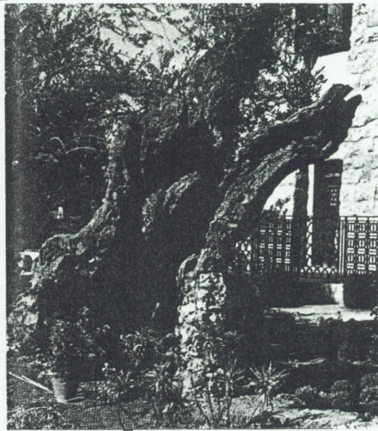
THE GARDEN OF GETHSEMANE