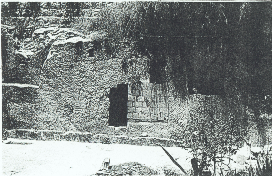
The Garden Tomb

"But if the Spirit of him that raised up Jesus from the dead dwell in you, he that raised up Christ from the dead shall also quicken your mortal bodies by his Spirit that dwelleth in you." Romans 8:11