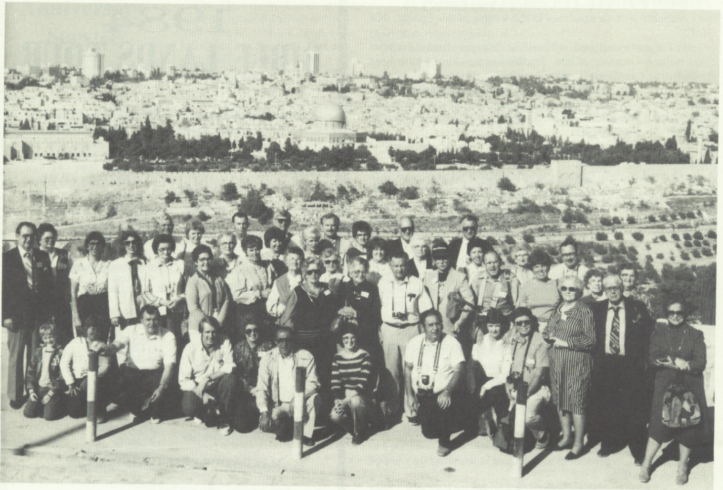
BUS NUMBER ONE