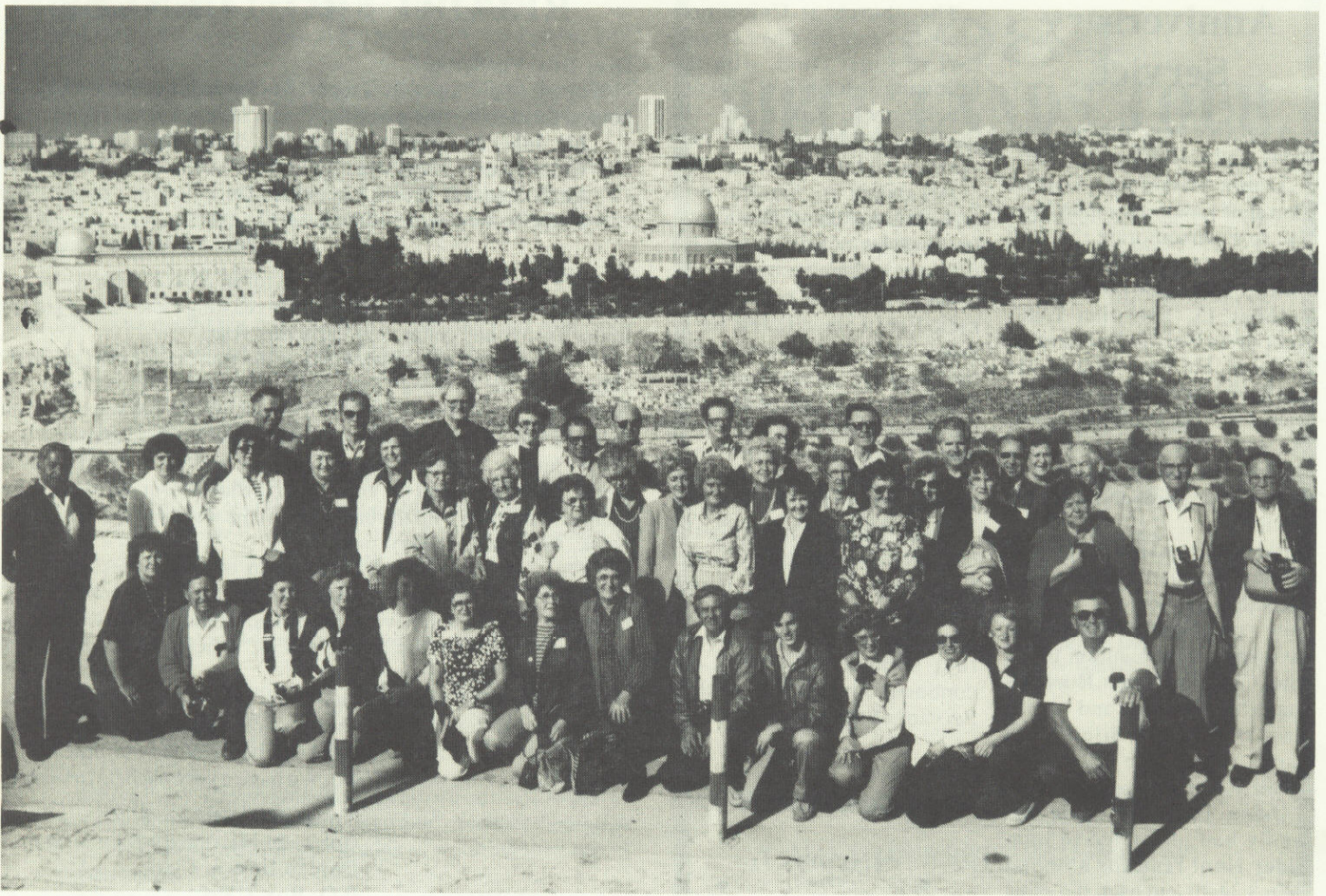
BUS NUMBER TWO