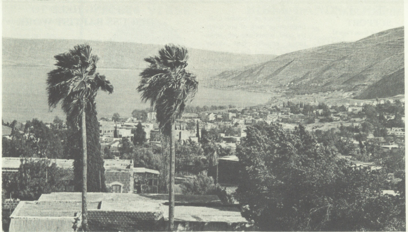
TIBERIAS ON THE SEA OF GALILEE