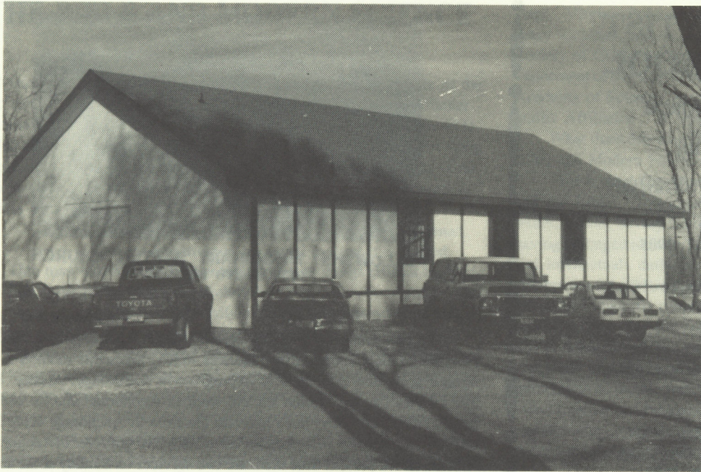
New church building at Denver