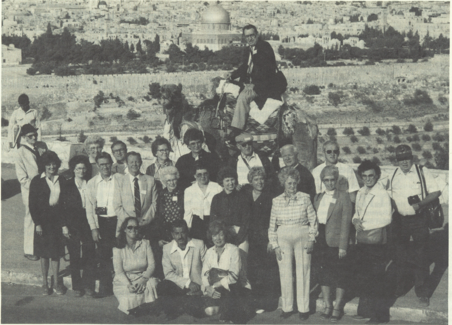
Tour Group on the Mt. of Olives overlooking Jerusalem