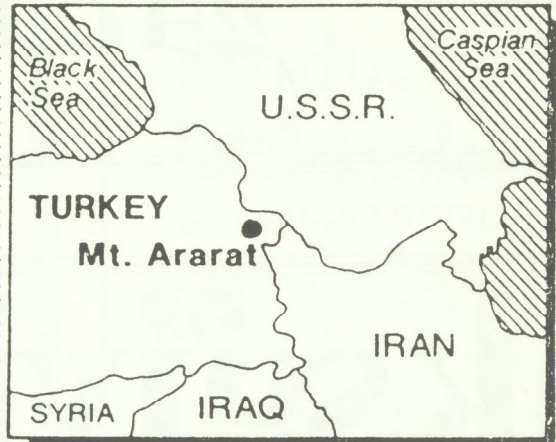
— AP Graphic