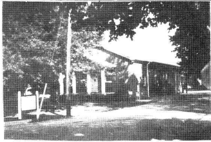
Fairview Memorial Baptist Church

The church invites everyone who can come to be present for a portion or all the services throughout the day.