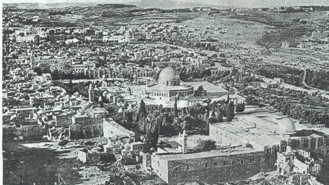
MOUNT MORIAH, THE "TEMPLE MOUNT"