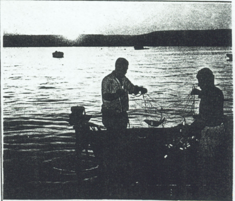
Sunrise over the Sea of Galilee