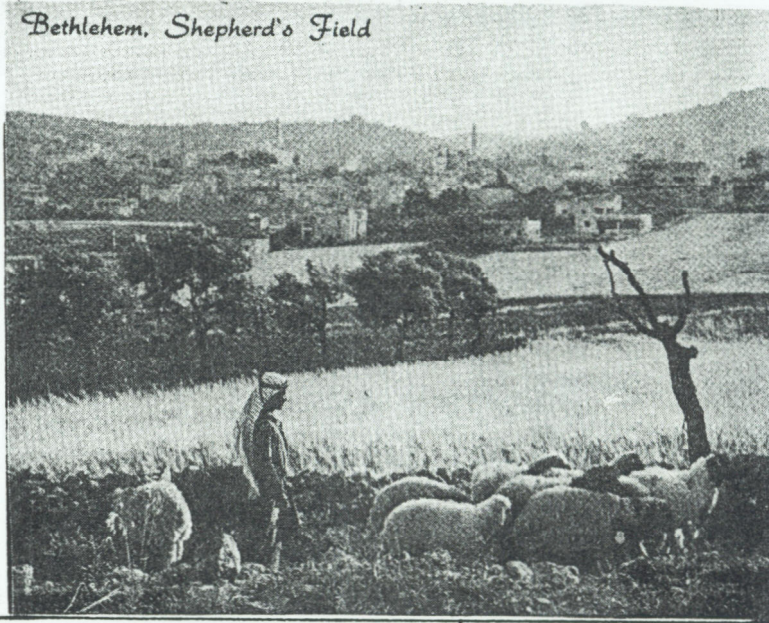
Bethlehem, Shepherd's Field