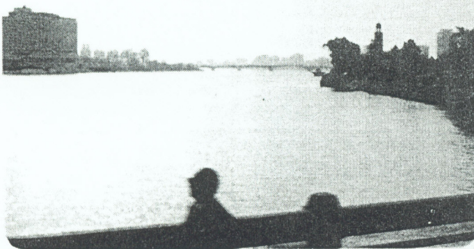
Nile River at Cairo, Egypt