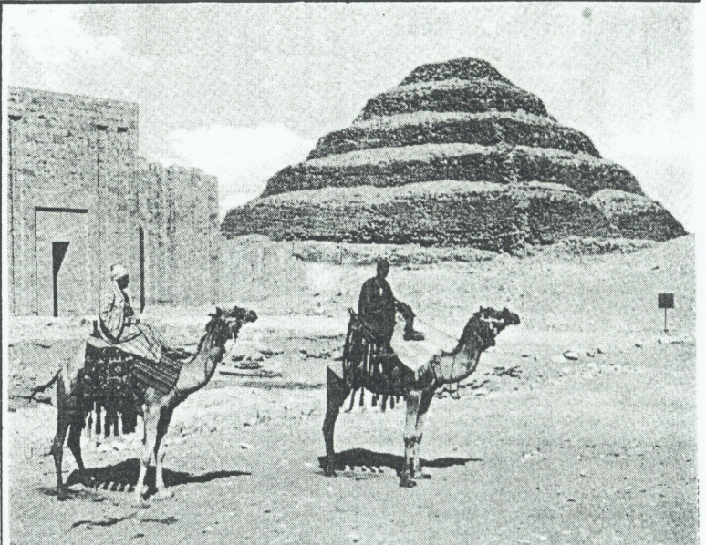
Pyramids of Egypt

Our Egyptian guide was Mr. Sayed (Moses) MoBarak. We travelled through the city of Cairo. The city seems to be the world's most crowded. Cars, side by side, far as you can see. It seems all have two horns and the most of them blowing. We were told the buses hardly ever hauled under one hundred people. Our group had a large modern bus all to ourselves. We could move around, change seats to see or make pictures. But those Egyptians! All seats were filled on their buses, all standing room was taken, some were hanging through the windows and the doors of the