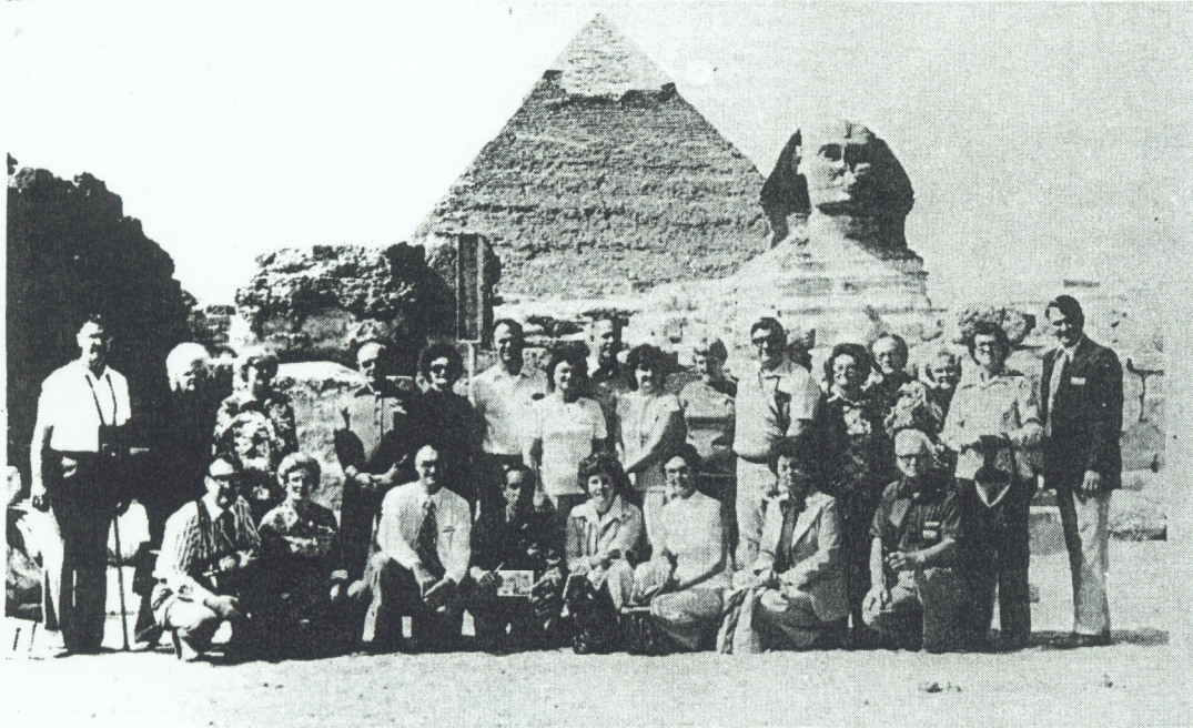
Our tour group at Memphis, Egypt