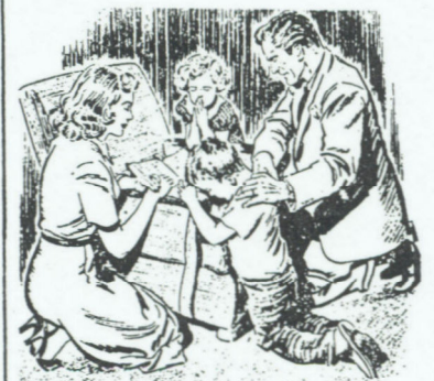
The Family Altar

Lord, if their guide I still must be Oh, let the little children see The teacher leaning hard on Thee.