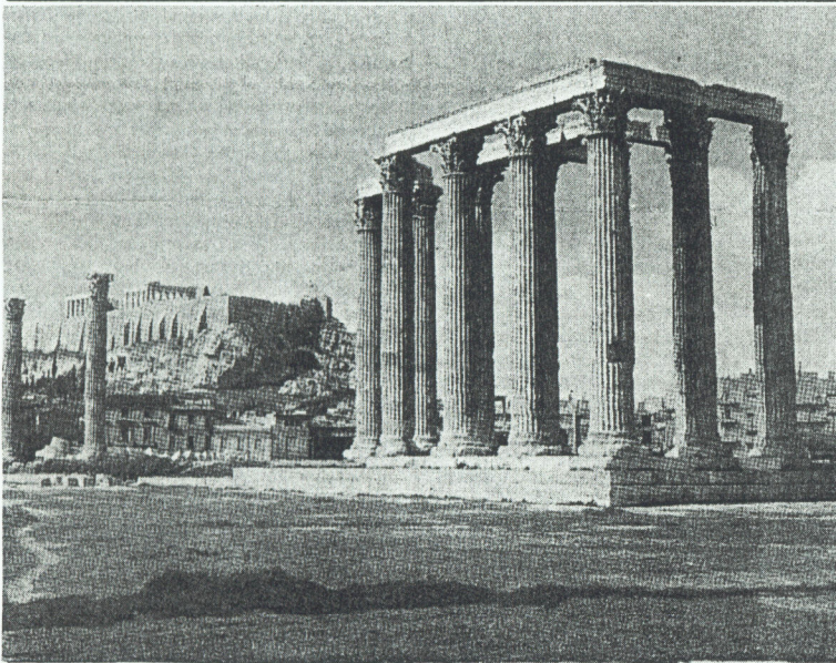
Ruins in Athens, Greece. Here Paul preached against sin and idolatry. Acts 17:15-16