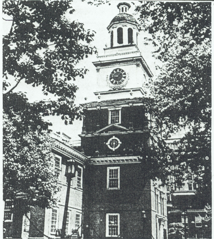
Philadelphia's Independence Hall, which houses Liberty Bell, witnessed the signing of the Declaration of Independence in 1776. Constitution was framed here, too.