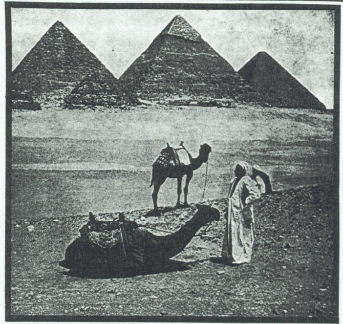
OLD WHEN THE ISRAELITES SAW THEM. That overwhelmingly distinctive feature of the Egyptian scene, the Pyramids of Gizeh, must have been a familiar sight to the Israelites, though, as the erection of these stupendous monuments was already ancient history, they evoked no comment recorded in the Bible. The period of the Pyramid Builders, kings of the 4th Dynasty, was 2900-2750 B.C., ending nearly 1200 years before the probable date of the Oppression.