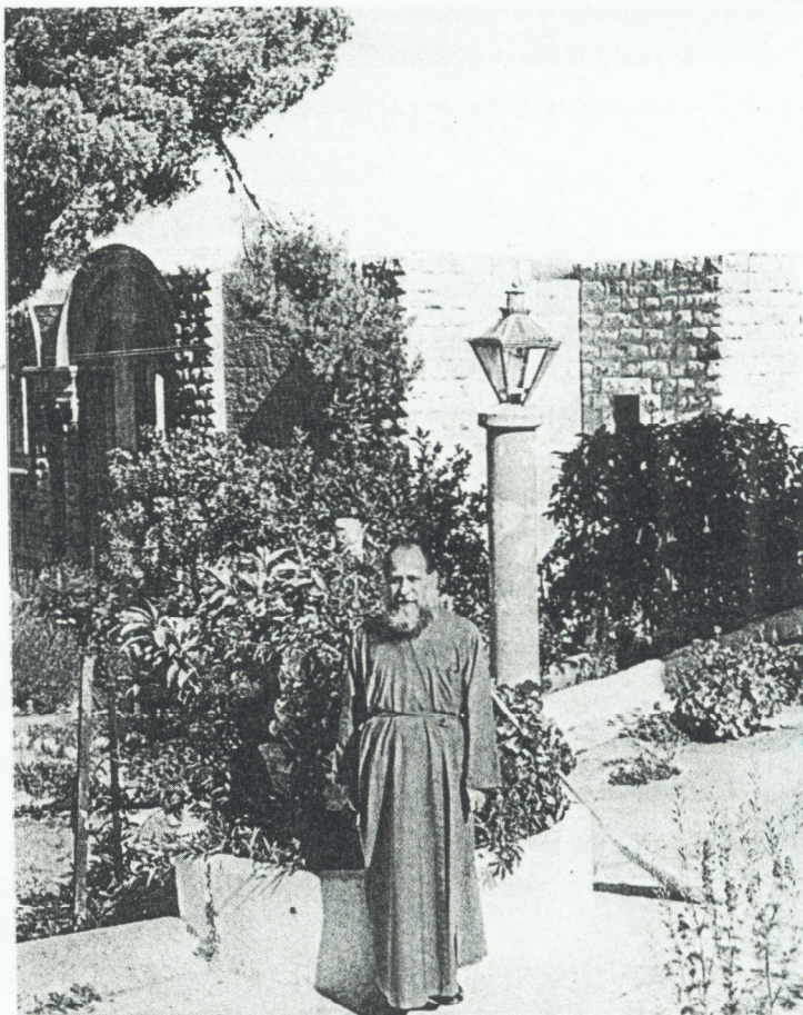
Jacob's Well in Sychar (Shechem - Nablus) (above) It was here that Jesus, "being wearied with his journey" asked the Samaritan woman for a drink of water (John 4:5-12). The ancient stone well curb is covered today by an uncompleted chapel, successor to several ancient ones that protected the site.

NEW YORK (AP) - At least one book of the Bible had been published in 1,631 of the world's languages and distinct dialects by the end of 1977, according to the American Bible Society.