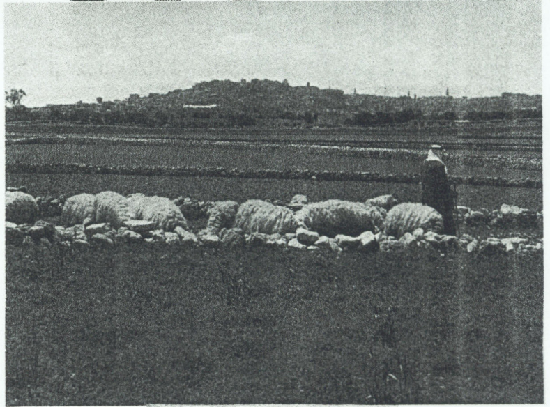
Bethlehem, Shepherd's Field