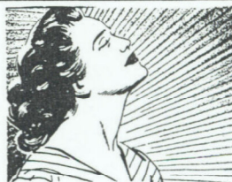
Lord, teach us to pray.