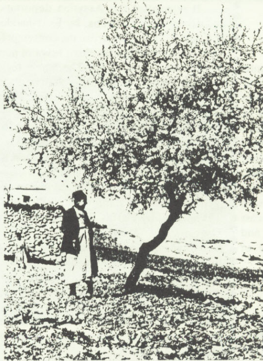
An almond tree in blossom in Palestine.

Apples of Sodom , mentioned by Josephus (BJ, IV, 8.4), but it is uncertain to what he refers.