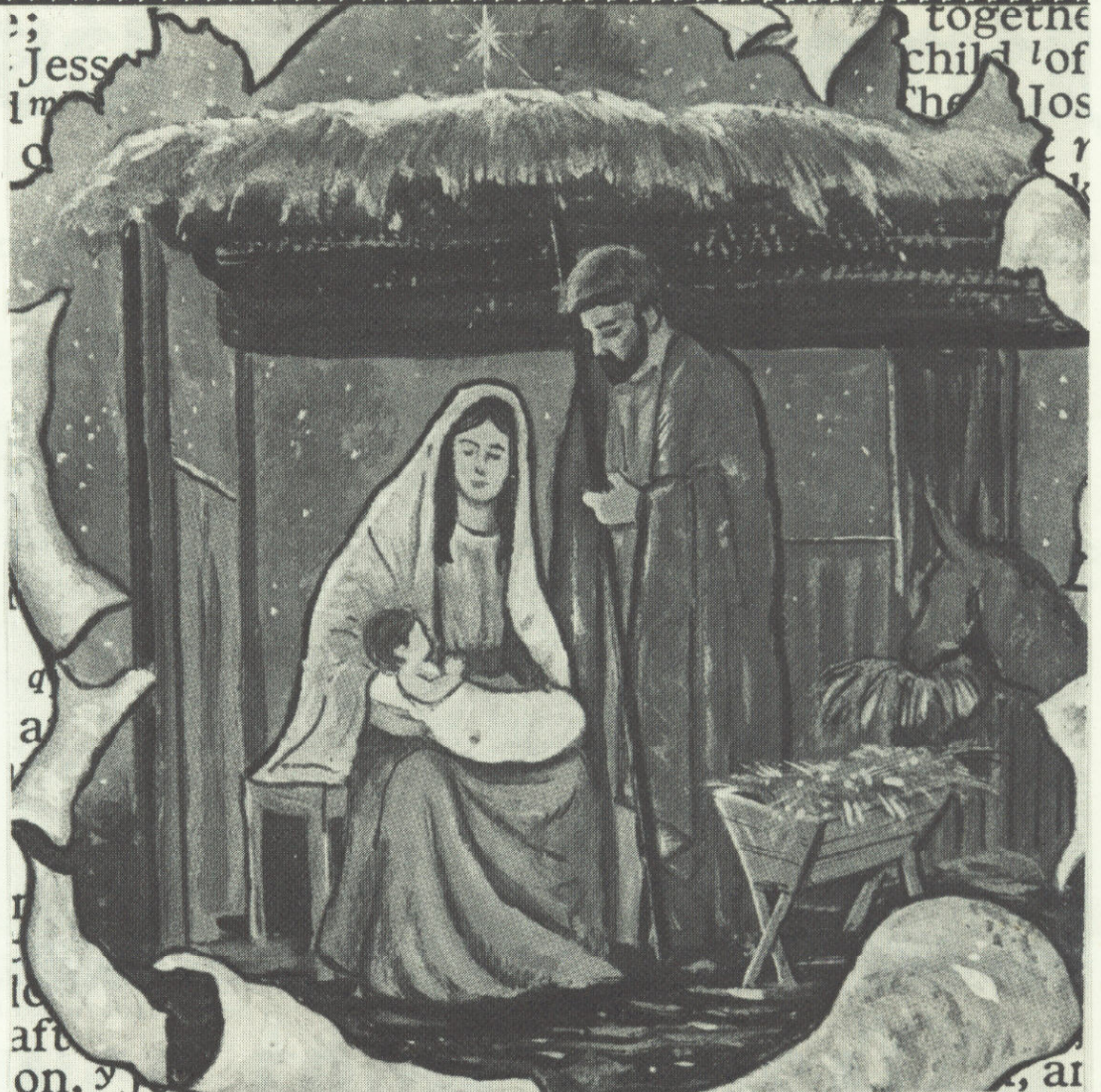
Glory to God in the highest and on earth peace, good will toward men.