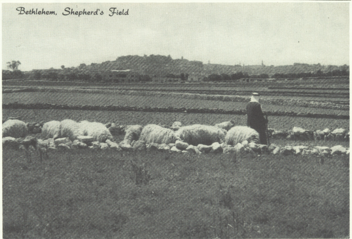
Bethlehem, Shepherd's Field

Mary was found with child by the Holy Spirit, Matthew 1:18-20. Without the virgin birth there could be no plan of redemption. The would be no other to save us, Acts 4:11-12.