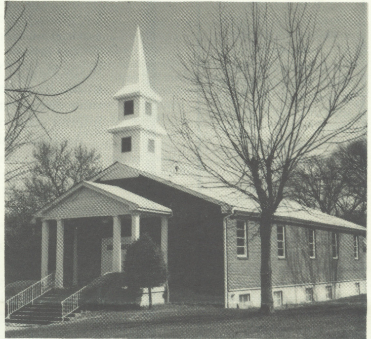
NEW BETHEL MISSIONARY BAPTIST CHURCH

Should you wish to call for school information, call: (615) 859-5780. The symbol of the school will be an open Bible and a burning candle. The motto: "Study to shew thyself approved unto God, a workman that needeth not to be ashamed, rightly dividing the word of truth." II Timothy 2:15.