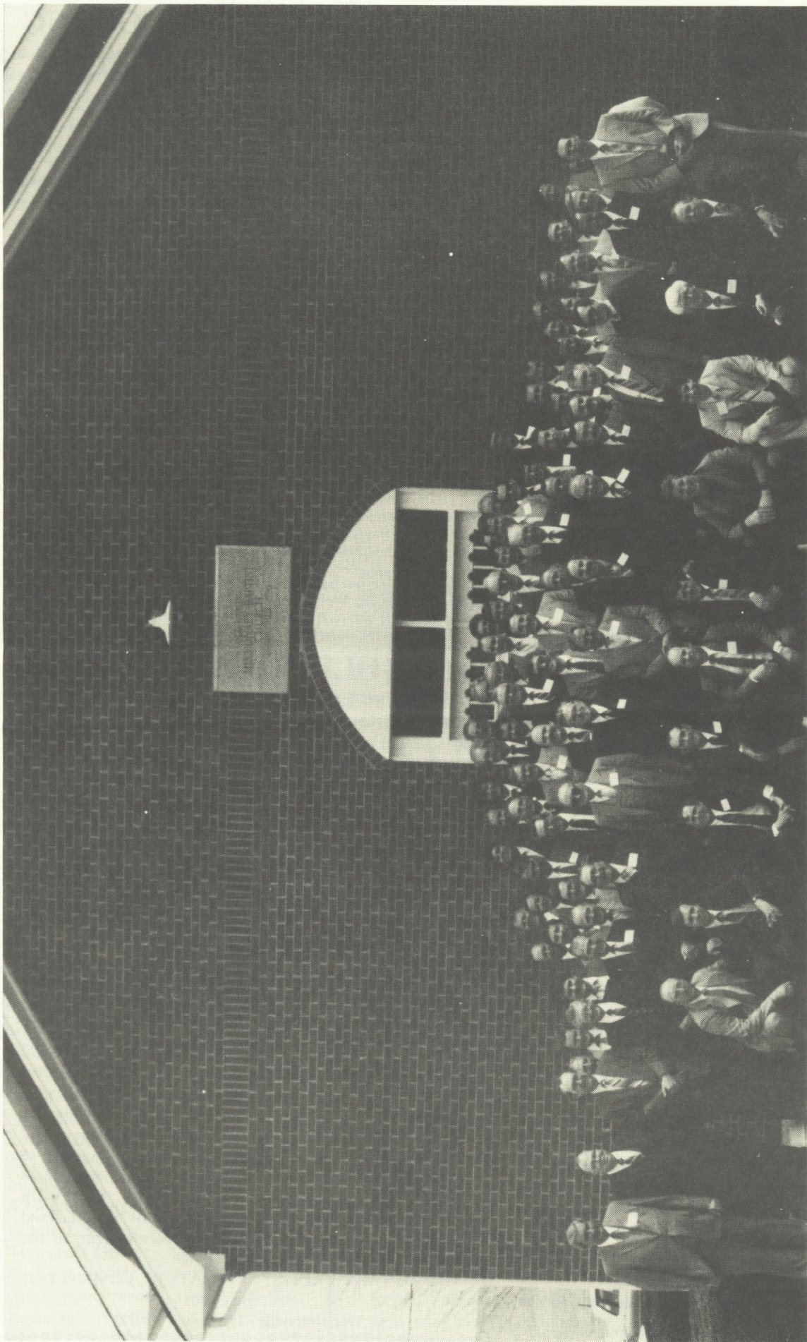
Pictured above are Baptist ministers attending the Old Union Baptist Ministers School Thirteenth Annual Session

March 27, 28, 29, 1985 - Bowling Green, Kentucky During the 13th annual session of the Old Union Baptist Ministers School, Bowling Green, Ky. which was held March 27-29, 1985, 90 Baptist Ministers from 13 states attended. States represented were Alaska, Arkansas, California, Georgia, Indiana, Kentucky, Michigan, Missouri, Ohio, Oregon, Tennessee, Virginia and West Virginia.