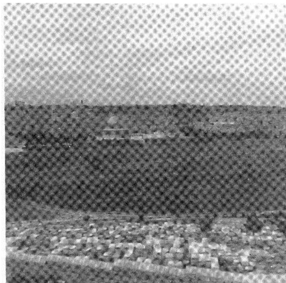
Jerusalem from Mt. of Olives