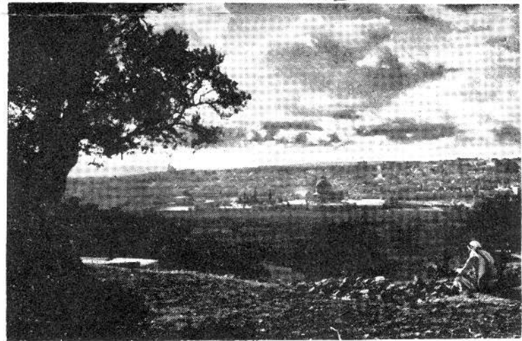
JERUSALEM FROM MT. OF OLIVES

Word has been received that, shortly after the death of Miss Prayer Meeting, her two sisters Miss Sunday Night Meeting and Miss Revival Meeting, also passed away. Burial was also in the Coldheart cemetery.