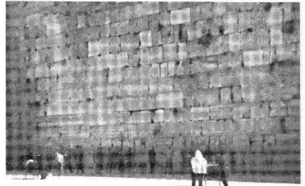
THE WAILING WALL