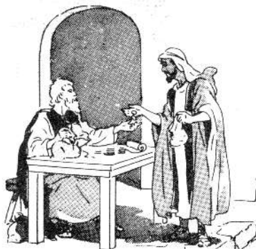
Matthew was a tax collector before Jesus called him as a disciple. MATTHEW 9:9

A system of buses with separate sections for men and women is being planned by ultra-Orthodox Jerusalemites — because of the "lack of modesty in dress" on Egge lines.