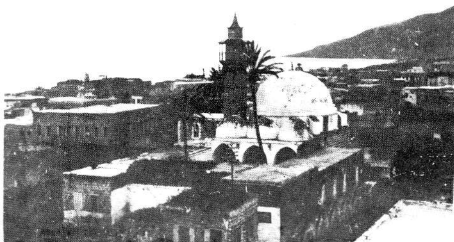
The city of Tiberias on the Sea of Galilee where Jesus called some disciples, Matt. 4:18