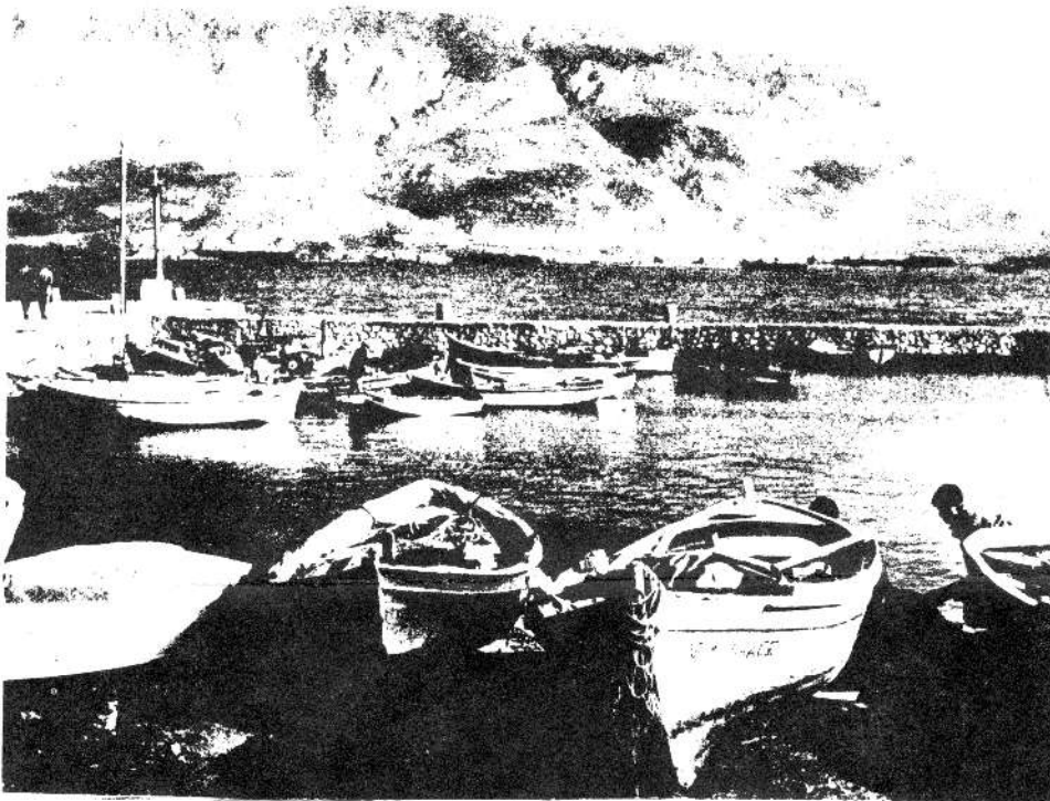
A fishing port near Corinth where the Apostle Paul did much preaching.