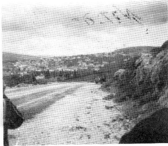
Cana of Galilee