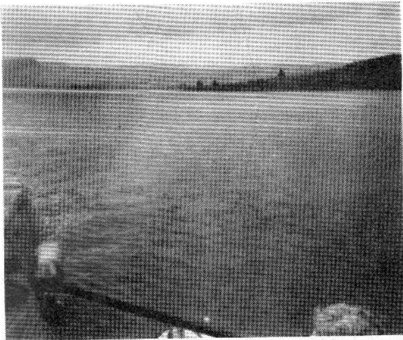
Sea of Galilee