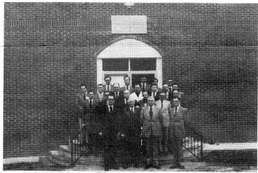
Pictured above are the ministers attending the Old Union Baptist Ministers School at Old Union Baptist Church, Bowling Green, Ky. in the first session March 27, 28, 29, 1973.