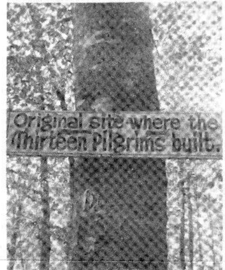
The above pictured sign is in the Park near the Old Mulkey Meeting House, Monroe County, Kentucky.