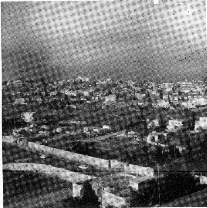
Section of Old Jerusalem