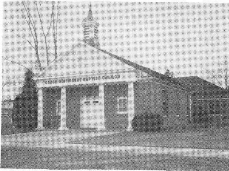
GRACE BAPTIST CHURCH