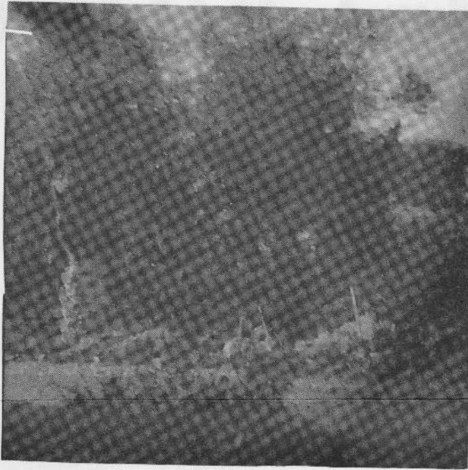
GARDEN OF GETHSEMANE AND MOUNT OF OLIVES