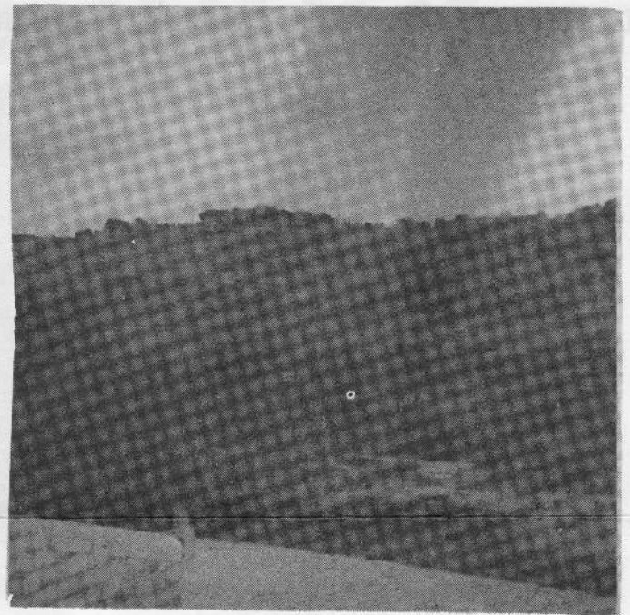
OLIVE TREES IN GETHSEMANE