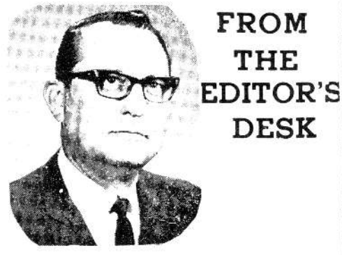
By H. C. Vanderpool

Subscription Rate — $2,00 per Year 3 Yrs. — $5,00, $1,50 in Bundles to Churches